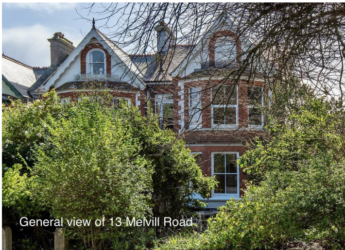
General view of 13 Melville Road